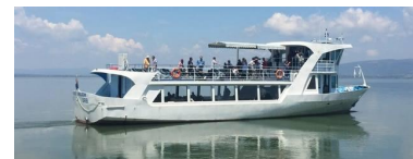
Putnički brod Aquastar Maxim

*Program se može neznatno promeniti do početka sezone