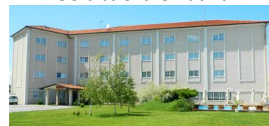
Hotel Aquastar Danube