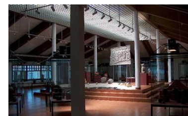
Arheološki muzej Đerdapa