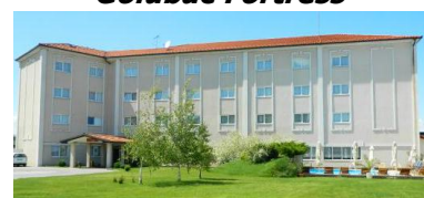
Hotel Aquastar Danube

3rd Day - Kladovo – Archeological Museum – HP Djerdap - Lepenski Vir – Golubac Fortress - Belgrade (240km) Breakfast at the hotel and departure by bus at 9:00 am. Visiting Djerdap's Archeological museum in Kladovo, whose exhibition covers remnants of different Danube cultures from prehistoric, Roman and medieval periods. Next stop is Hydro plant Djerdap, built in 1974.y as the biggest project of the year in Europe. It significantly changed the position of the Danube River, the local villages as well as cultural and historical monuments that are located nearby. Driving along the Danube River towards Donji Milanovac, lunch break. Arriving at the archaeological site Lepenski Vir, which was known as one of the oldest European and world urban settlements, as well as culturally advanced for the Middle Stone Age period (6500 BCE). The journey continues on towards Belgrade, with a short stop at the Golubac Fortress. The fortress was built in mid-14th century, and was many times demolished and rebuilt as a border fortress between Serbia, Hungary and Turkey. This is where the official sightseeing and program ends and after a short drive, arrival in Belgrade is expected in the early evening.