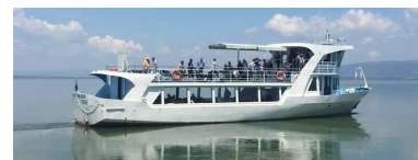
The Aquastar Maxim ship

1st Day. Belgrade - Smederevo - Ram - Veliko Gradiste - Golubac – Djerdap Gorge - Donji Milanovac - Tekija –Kladovo (240km): (Meeting passengers) Passengers arrive at the Port of Belgrade (Karadjordjeva Street, next to the Branko's Bridge) at 7:30 a.m. Boarding till 7:40h. Aquastar Maxim cruiser departs at 7:50 am. Cruise starts from the famous Belgrade fortress towards Kladovo, passing by Smederevo Fortrss, the confluence of the Morava and Danube rivers, medieval fortress Ram, in the area where the Danube is the widest in Serbia. Ram fortress was built in the late 15th century on the site which was later known as safe point for entering/exiting then occupied Serbia. Cruise continues then to the Silver Lake and Veliko Gradiste, passing Golubac Fortress where we enter the National Park Djerdap, also known as the Iron Gate. We cruise through the longest and deepest gorge in Europe, area of unique flora and fauna, where remains of one of the oldest European settlements can be seen. Passing Donji Milanovac, you will have the opportunity to visit the place where the Roman Emperor Trajan left a permanent imprint on the rock, known as Tabula Traiana. Arriving in Tekija after a 9.5 hour cruise. Short bus transfer to Kladovo. Accommodation at the Hotel "Aquastar Danube". Dinner. Overnight.